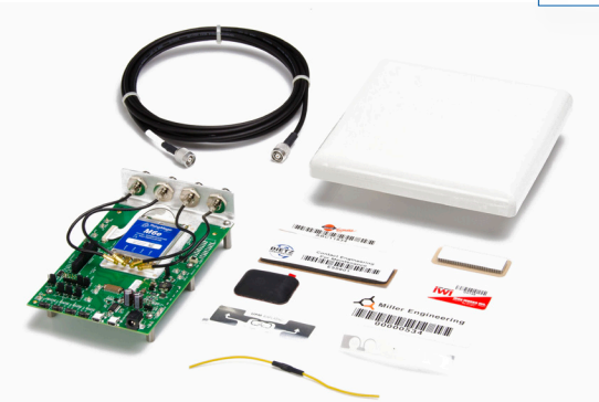
M6e Reader DevKit shown

A utility for advanced demo, testing, and tuning of all ThingMagic readers. Reduces complexity for novice users while permitting low-level control for advanced developers.