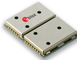
22.4 x 17 x 3 mm

The LEA-5 module series brings the high performance of the u-blox5 positioning engine to the industry standard LEA form factor. These versatile, stand-alone receivers combine an extensive array of features with flexible connectivity options. Their ease of integration results in fast times-to-market for a wide range of automotive, consumer and industrial applications with strict size and cost requirements.