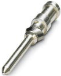
Turned 1.6 crimp contact, individual male contact, core diameter 0.14 to 0.37 mm 2 , silver-plated

Please be informed that the data shown in this PDF Document is generated from our Online Catalog. Please find the complete data in the user's documentation. Our General Terms of Use for Downloads are valid ( http://phoenixcontact.com/download )